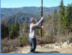
Jake clowning around pretending to climb the tree limb.