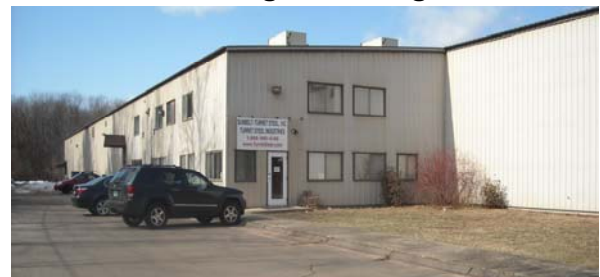
Sunbelt-Turret South Windsor, CT Location