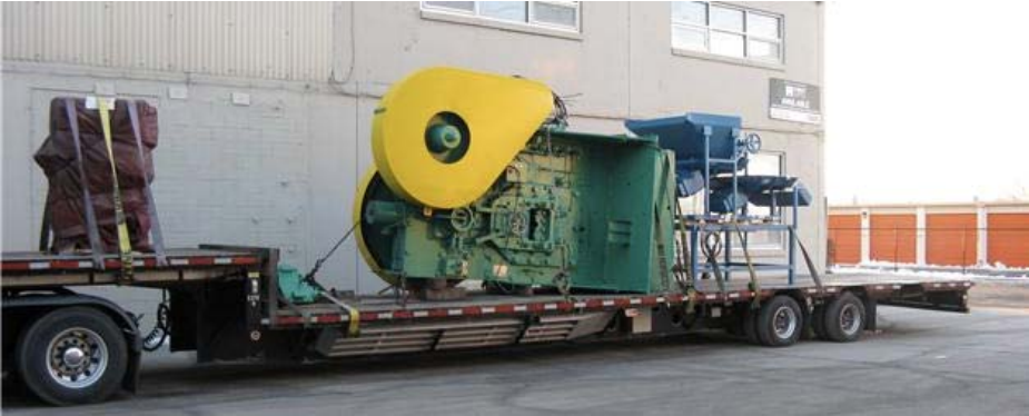
Peddinghouse shear going to Chicago. Look at the "sheer" size of it!