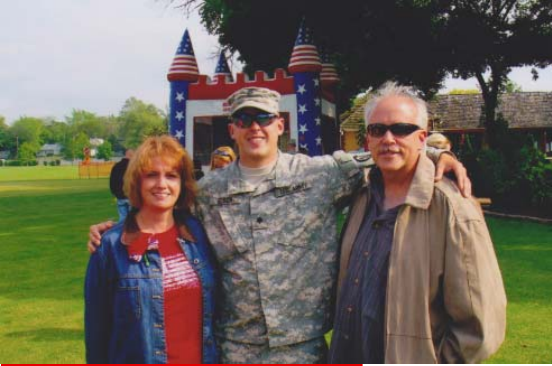
Pictures of Deb Besch's son (seen left and right) back in the USA while on leave from duty in Afghanistan.