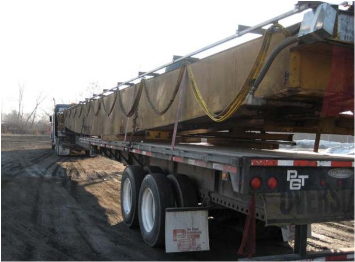
Warren, Ohio's newest addition: a P&H crane rolling in